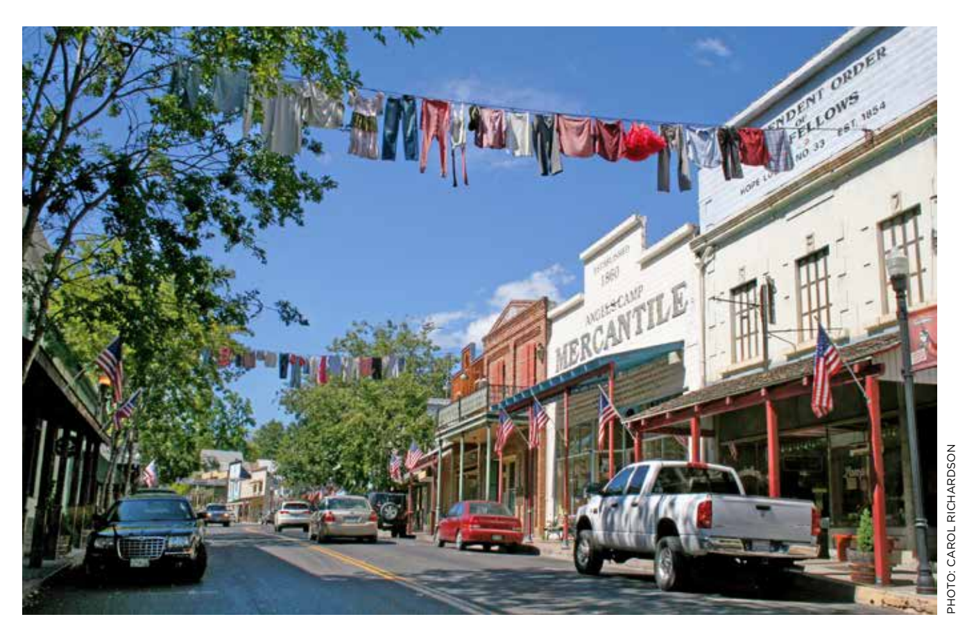
Above: Historic downtown Angels Camp. Below: Chatom Vineyards.

storefronts and wood-plank sidewalks. Though this gilded region may not pop on the radar like California's higher-profile golf destinations such as Palm Springs or Monterey, the mother lode lays claim to a glittering lineup of courses to push the needle on the golf junket meter.