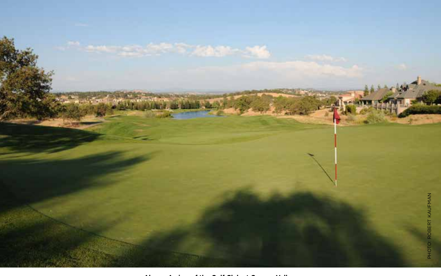
Above: A view of the Golf Club at Copper Valley. Below: Renner Winery.