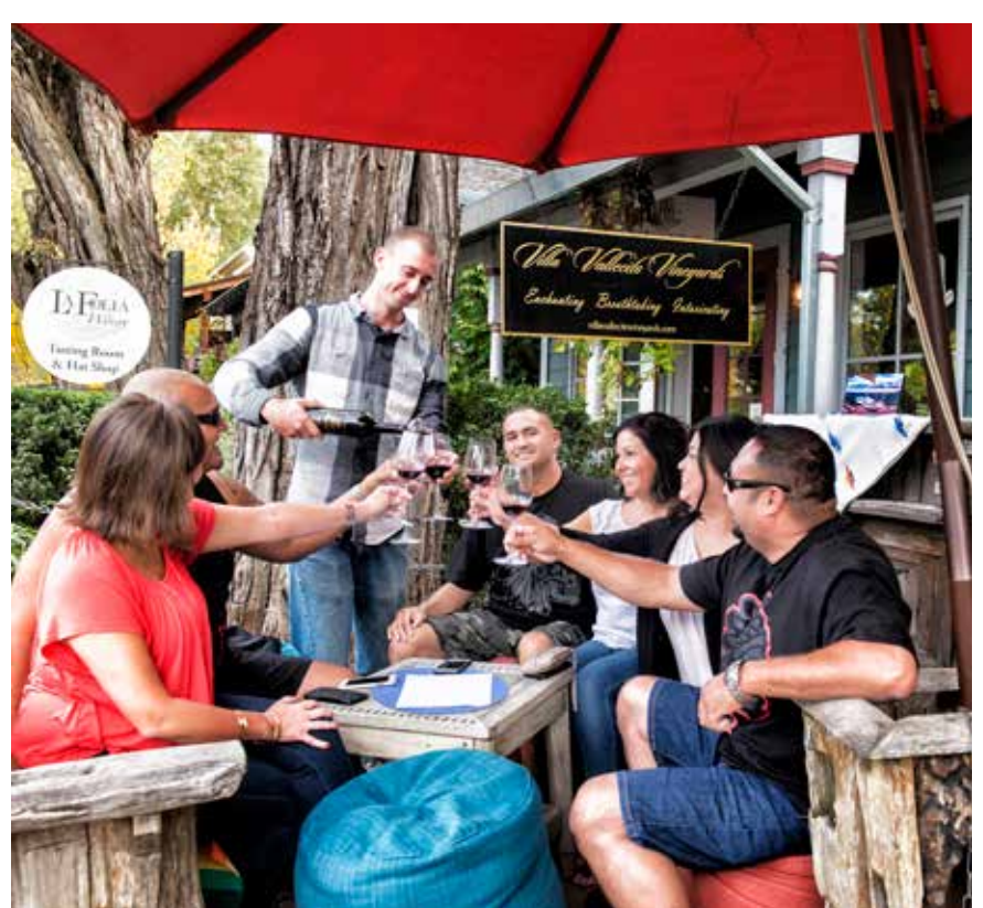
The atmosphere in the village of Murphys offers a welcome reprieve from hooks and shanks of the area's many golf courses.

If ever there was a perfect venue for buddy trips, Greenhorn Creek broke the mold on lodging options with the Caddy Shack. Just steps away from the ninth fairway, this laidback dwelling contains five bedrooms to accommodate up to 12 guests, a 55-inch HD TV, fully equipped kitchen and a private fenced yard with an outdoor grill and horseshoe pit.