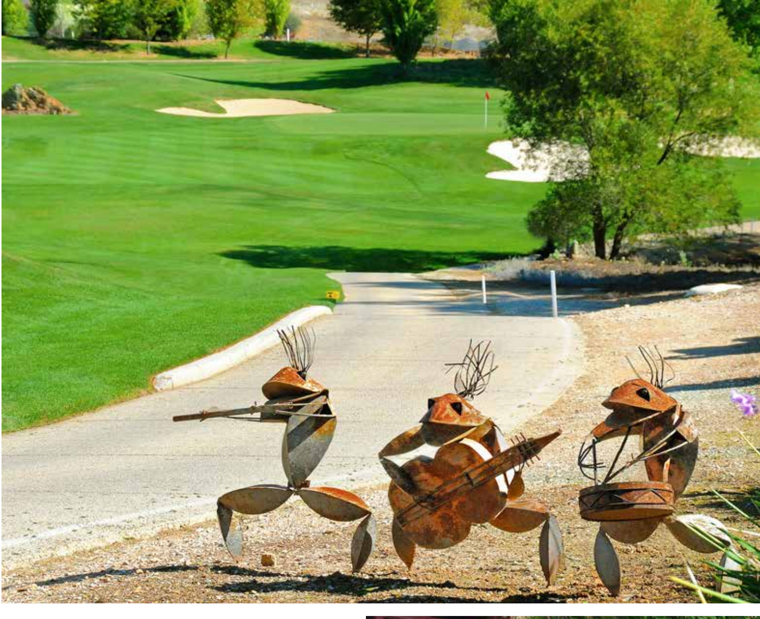
The influence of Mark Twain's famous short story "The Celebrated Jumping Frog of Calaveras County" can't be missed at Greenhorn Creek.